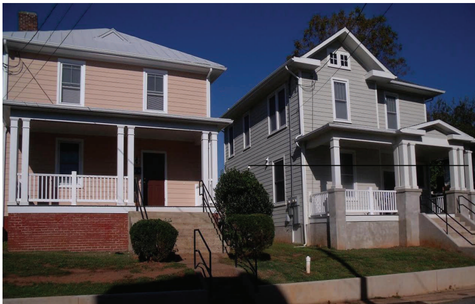
2011 Grace Street 1680 sq ft. -Built c.1916

If you would like to purchase a calendar and are unable to attend a membership meeting or visit one of the sites listed, please feel free to contact DHHS historian and she will make arrangements to get one (or more) to you. The calendars make wonderful gifts and are a great souvenir for family and friends who may visit Lynchburg during the holidays. Please encourage your friends to support this fund raiser – the proceeds all go to the maintenance of the gardens on Diamond Hill.