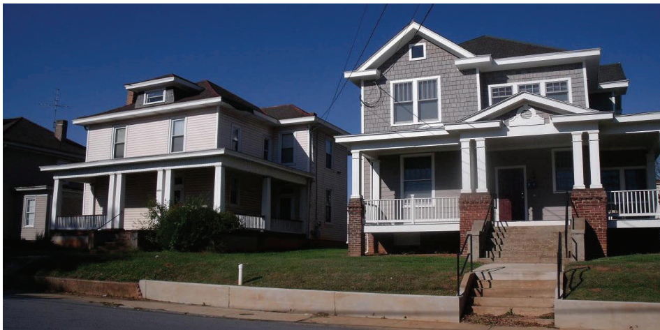
2003 Grace Street 2578 sq ft. - Built c.1919

The lots of all four houses 2003, 2005, 2011 and 2019 Grace Street were part of the Campbell County Annexation in January 01, 1870. If you have not seen these houses make sure to take exit 2 from 29 North . You can see them from the corner of Grace and Robins Street.