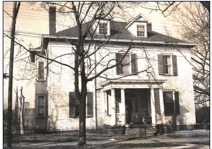
By 1969 the house had lost its balustrade.