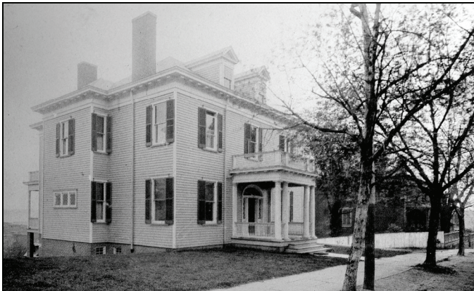
View of 401 Washington Street as it appeared about 1903. Note the original balustrade over the front portico of this new house which appeared in Art Work of Lynchburg and Danville, Virginia