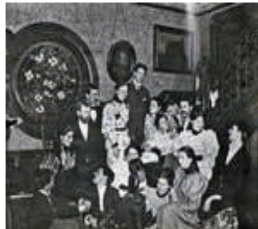
John Kinnier House